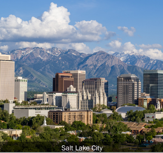
Salt Lake City