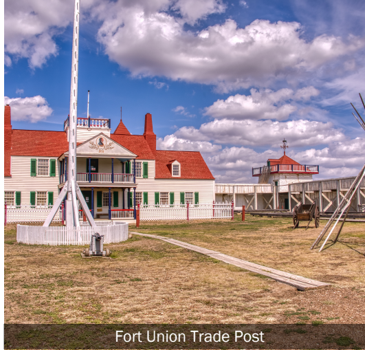
Fort Union Trade Post