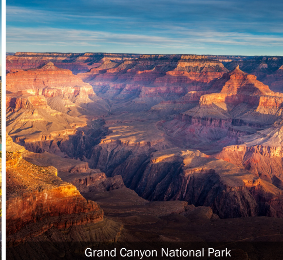
Grand Canyon National Park