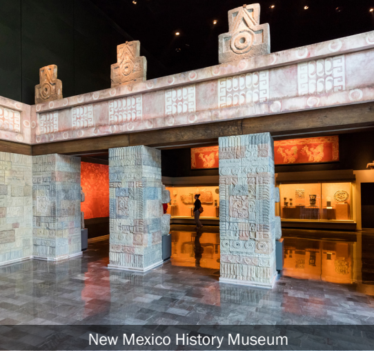
New Mexico History Museum