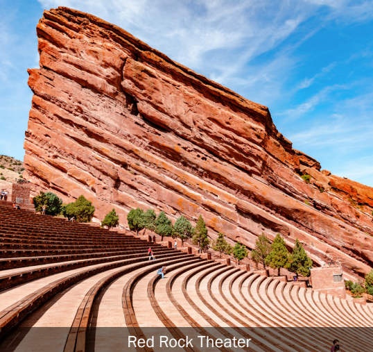
Red Rock Theater