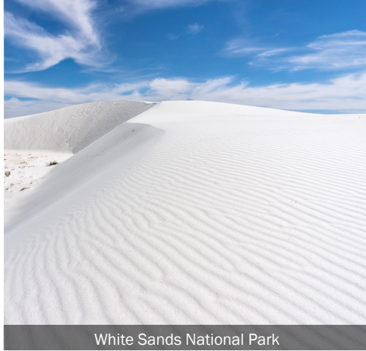
White Sands National Park