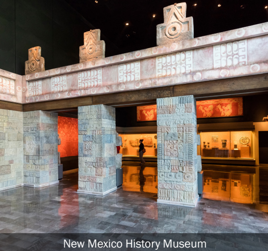
New Mexico History Museum