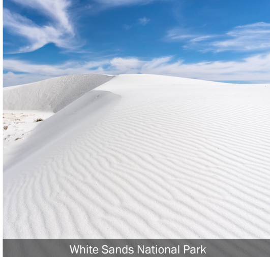
White Sands National Park