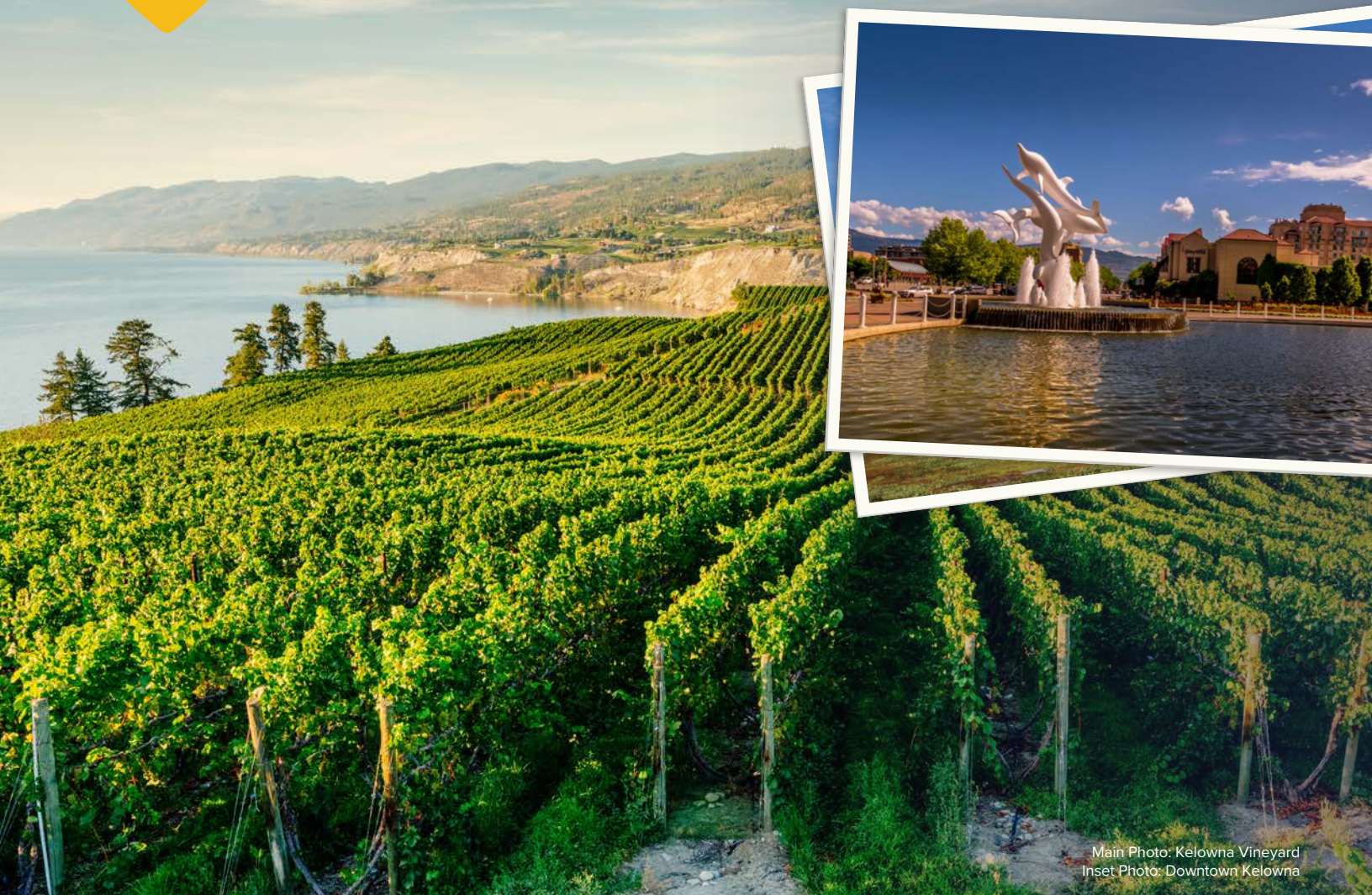
Main Photo: Kelowna Vineyard Inset Photo: Downtown Kelowna