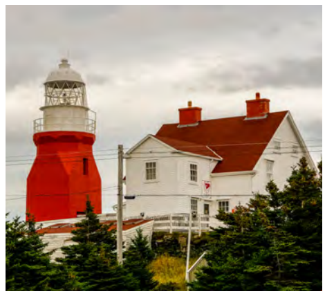
Long Point Lighthouse

Visit the Grenfell Interpretation Centre, Charles S. Curtis Memorial Hospital to view the Jordi Bonet Murals and tour the Grenfell House Museum. Depart for L'Anse aux Meadows National Historic Site. This was the home of Leif the Lucky and the Viking people who settled here. Tour the reconstructed sod huts as animators recreate daily life at the site. Departing for Rocky Harbour enjoying more interesting and historical stops enroute. Visit Arches Provincial Park, to view a natural rock archway created by eons of tidal action. Arriving in Rocky Harbour, check into your hotel for a two-night stay!