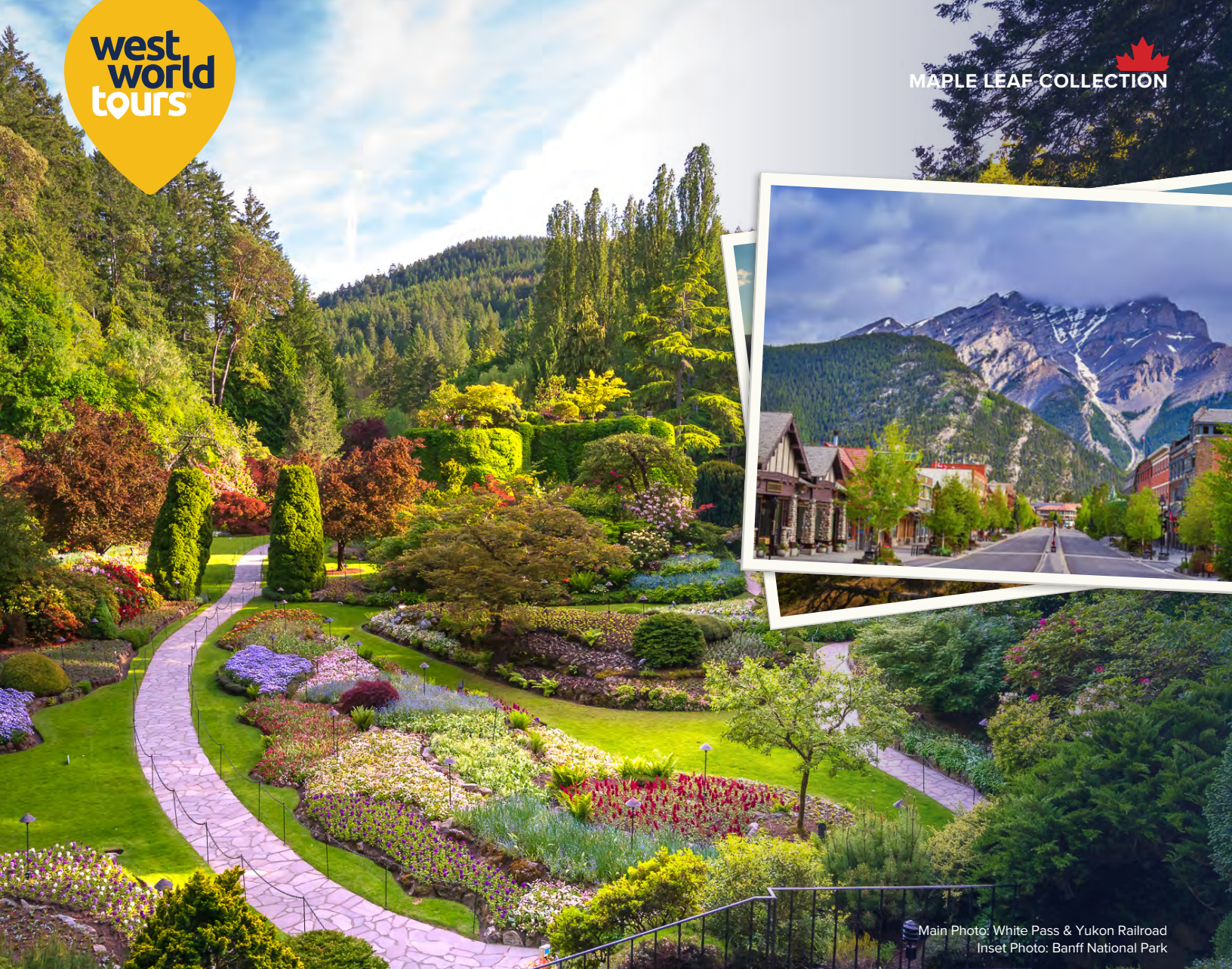
Main Photo: White Pass & Yukon Railroad Inset Photo: Banff National Park