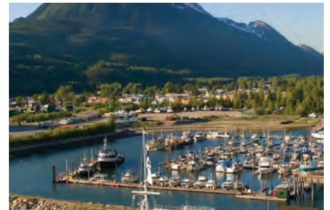
Skagway Boat Harbour

Board our coach for Butchart Gardens. For over 90 years this amazing 50 acre garden has been a symbol of Victoria's beauty. We will also stop at the Butterfly Gardens today.